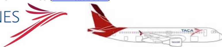
New Airbus A-321